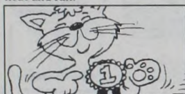
The first cat show was held in 1871.