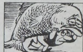
Some saltwater bass weigh more than 500 pounds.

"I feel that (the city's other doctors) can handle things well," Hall said. "But I'll be around to add my 5 cents' worth if I'm asked."