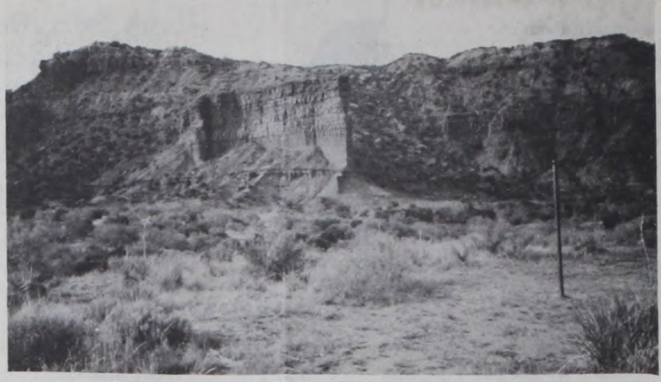
THIS BEAUTIFUL VIEW of the Caprock Canyons is typical of views from the Rails to Trails trail, which is being celebrated in Quitaque June 4.