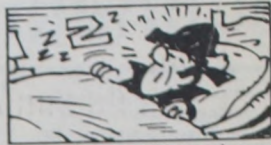
Napoleon was a well-known insomniac and had to get by on three or four hours of sleep a night.