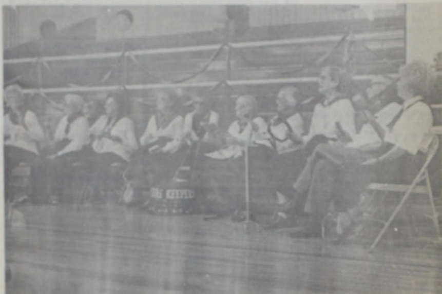
Quitaque performers, the Timekeepers, entertain at Homecoming Celebration at Valley School August 4.