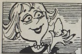
Yams tend to be more moist, sweeter and more orange-colored than sweet potatoes.