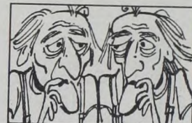
The chances of identical twins both reaching the age of 100 are about one in 50 million.