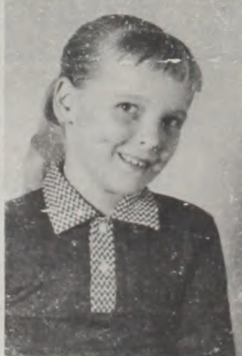
Guess How Old Now! HAPPY BIRTHDAY