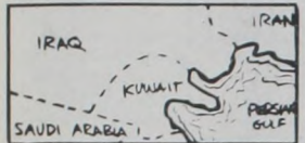
Kuwait is slightly smaller than the state of New Jersey.