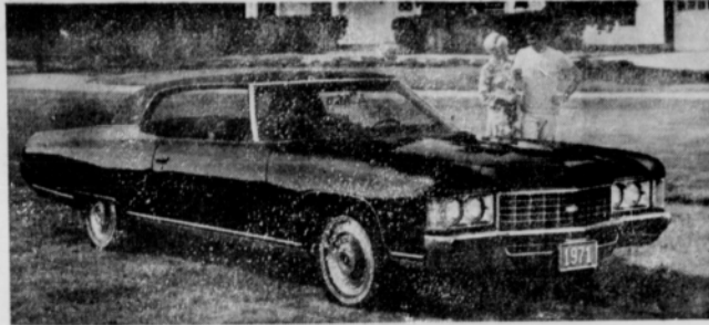
The 1971 regular Chevrolets are the most luxurious the division has ever built. There is greater glass area for improved visibility. Glass and body contours are more rounded. Flush lift-up door handles add to body smoothness. The Caprice gets added distinction with a special large grid grille, deep ribbed wheel covers and standard rear fender skirts. Wheelbase of regular Chevrolet is extended 2.5 inches for added riding comfort and increased rear leg room. The body has a new flow-through ventilation system and greater strength double-panel roof construction. The new chassis and suspension system give improved ride and handling. A power disc/drum brake system is standard.

Club president Mrs. Ashb White, brought the president message "Power of Women".