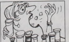
Most of the major drugs used today have been discovered in the 20th century.