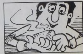
Dry ice is actually solid carbon dioxide. It changes from gas to solid without becoming liquid.

PIZZAS FOR SALE By The Junior Class JANUARY 6-4 TO BE DELIVERED SUNDAY JANUARY 25 BETWEEN 3 PM & 5 PM