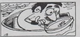
The smallest flowering plant known is the duckweed, a perennial that floats on pools and ponds.