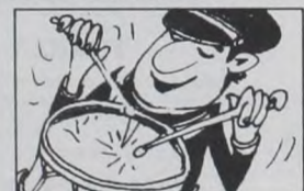
The oldest known musical instrument is the drum.