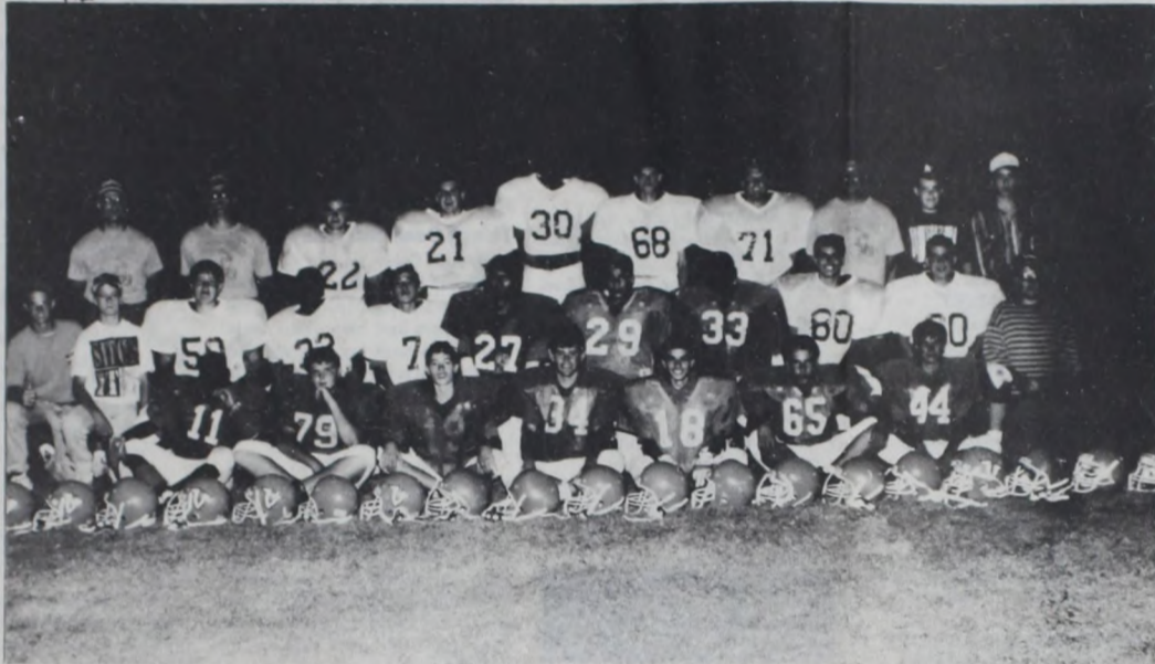
VALLEY PATRIOTS 1992 HIGH SCHOOL FOOTBALL TEAM