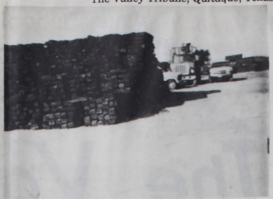
End of an era cross-ties being stacked and trucked out at Turkey Crossing.