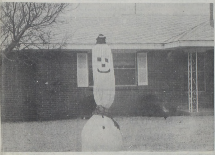
Frosty the unmeltable Snowman......can be seen at the Randy Stark home in Quitaque

The banquet is open to the public. Everyone is asked to bring a covered dish to help with the meal.