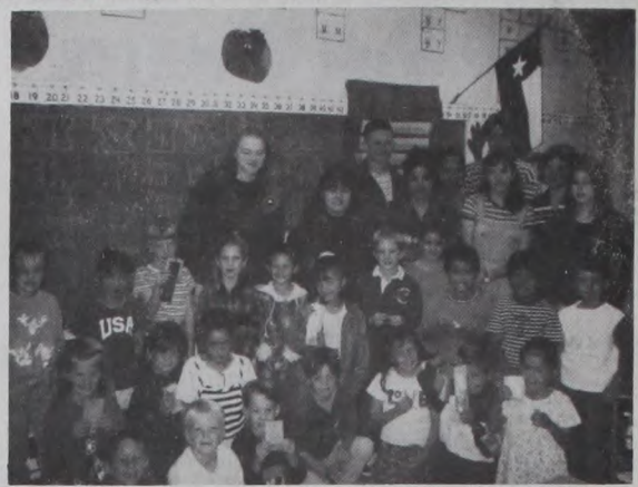
Freshmen FHA members with first grade class holding their dough ornaments and ribbons.

Do you have questions or concerns about taking prescription medicines safely? Call 1-800-889-3870 for a free Merck-Medco brochure on safe prescription use. For information on bone health after menopause, call the Bone Health hot line at 1-800-678-6672.