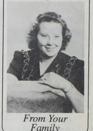
From Your Family