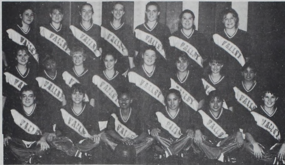
1996 LADY PATRIOTS