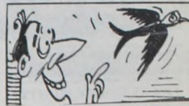
Some people believe it good luck to see a swallow or a stork.

"TEXAS" annually selects a cowboy artist's work to enhance the western tones projected in the outdoor drama's script. The western scenes scattered throughout the souvenir program are vivid reminders of the culture upon which "TEXAS" is based.