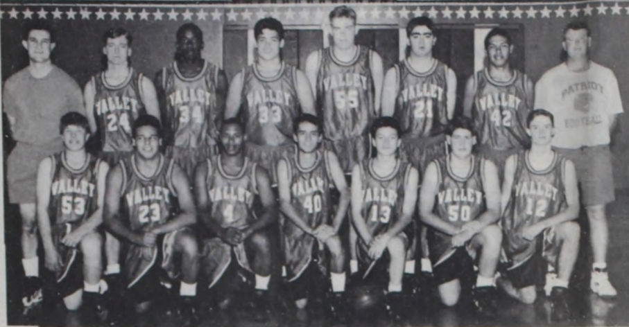
VALLEY PATRIOTS BASKETBALL TEAM