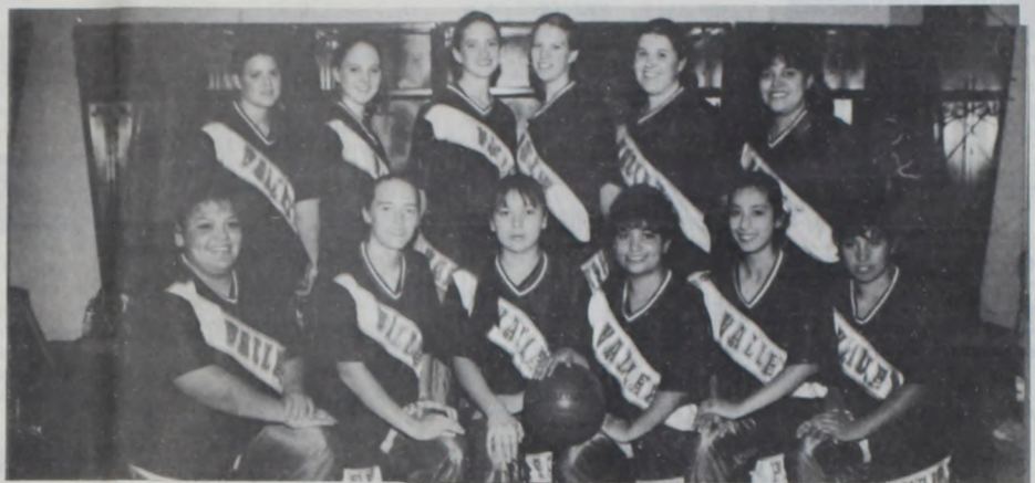
LADY PATRIOTS BASKETBALL TEAM