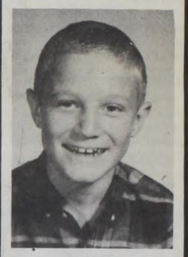
Мом & Виск

When it comes to price, selection and service, you can't beat us!