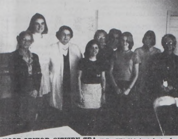
HOST SENIOR CITIZEN TEA -Valley FHA Girls hosted a tea for Turkey Sienior Citizens on November 16.