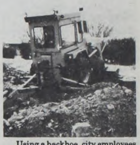
Using a backhoe, city employees begin search for old Turkey Elementary school bell.

by Ann Coker It was just like a time capsule that was uncovered at the site of the old cistern at the former Elementary School, on the north side of town, near the Church of Christ.