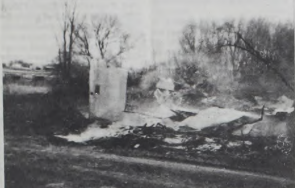
REMAINS OF FOSTER PLACE AFTER FIRE TUESDAY

VOLUME 36 NUMBER 36 6 PAGES BRISCOE COUNTY QUITAQUE, TX 79255 THURSDAY, FEBRUARY 20, 1997