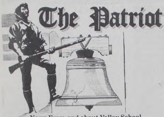
News From and about Valley School