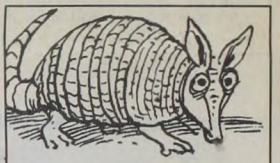
An armadillo is protected by its shell, which acts like a suit of armor.

During the 1400s many European women wore tall, cone-shaped hats called hennin . The hat measured three to four feet high.