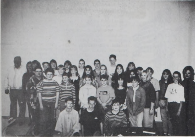
District Champions - Valley Jr. High UIL Participants