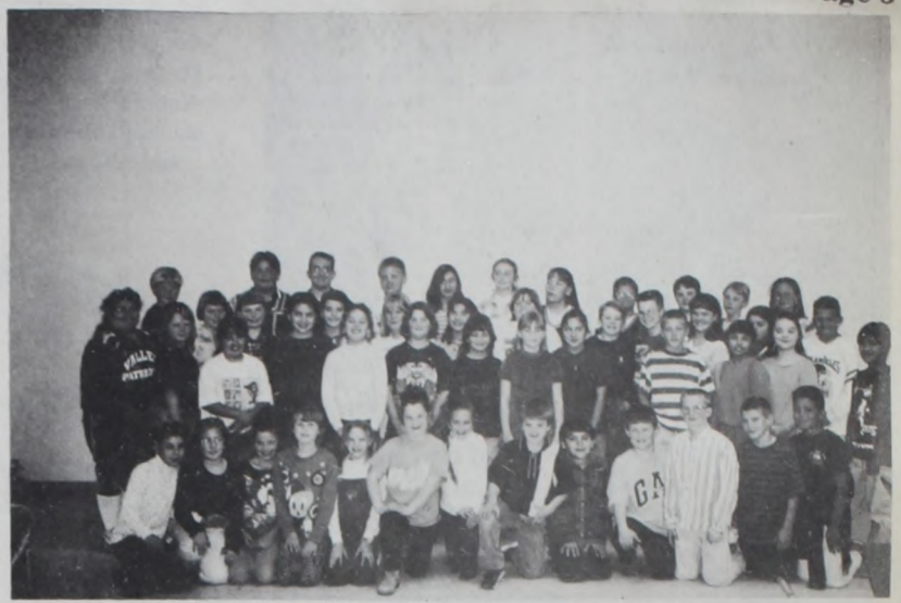
District Champions - Valley Elementary UIL Participants