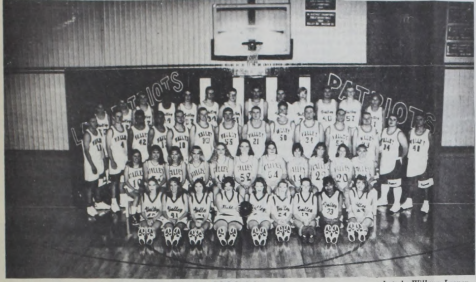
1998-99 VALLEY PATRIOTS & LADY PATRIOTS