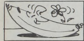
Bananas breathe. They inhale oxygen, exhale carbon dioxide and generate their own heat.