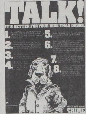
Crime Prevention (1978-1988). Thanks to Crime Dog McGruff, over 19 million Americans participate in block watch groups in 100,000 neighborhoods.