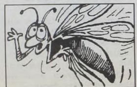
Scientists believe that ants gradually developed from wasps more than ten million years ago.