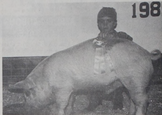
Jarret Pigg- Reserve Crossbreed Hog, purchased by donors from Quitaque, Turkey and Silverton