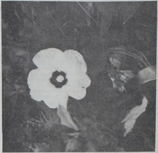
The fruits of someone's summer labors - a beautiful hibiscus flower graces this plant.

The Valley Tribune will not be publishing a paper on August 19, 1993. The Tribune office will be closed from August 14 through August 22. If you have anything needing published for this time, please bring it to the office by August 10 to be printed in the August 12th issue of the paper.