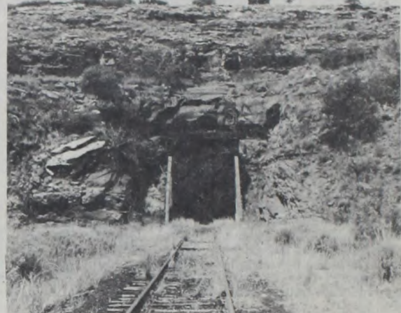
Old Railway Tunnel To Be Part of National Park System.