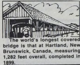
The world's longest covered bridge is that at Hartland, New Brunswick, Canada, measuring 1,282 feet overall, completed in 1899.