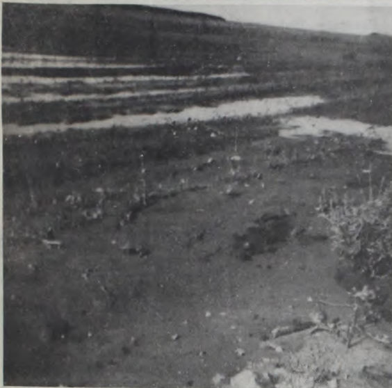
BEDRAGGLED COTTON ON THE RALPH CARTER FARM AFTER SUNDAY NIGHT'S STORM.