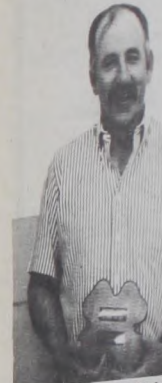
Bill Brooks and Rick Leader Awards.