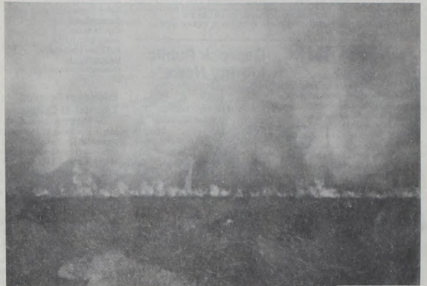
DENSE SMOKE BILLOWS up from a fire on CRP land north of Quitaque Monday. The fire, fed by dry grass and fanned by high winds, was presumed started by lightning. A northwest wind blew the smoke across the town, but the Quitaque volunteer fire department made short work of extinguishing the blaze.

A full day and night activities has been planned starting Saturday morning, September 18, 1993.