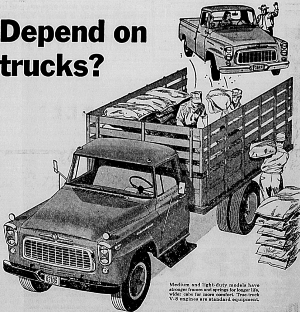
Medium and light-duty models have stronger frames and springs for longer life, wider cabs for more comfort. True-truck V-8 engines are standard equipment.