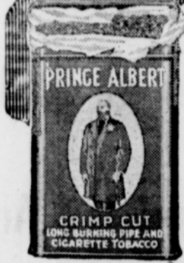
Copyright 1919 by R. J. Reynolds Tobacco Co.

Right now while the going's good you get out your old jimmy pipe or the papers and land on some P. A. for what ails your particular smokeappetite!