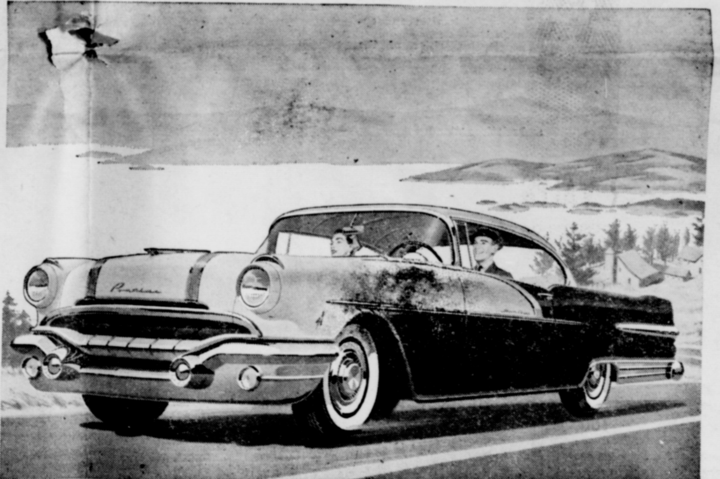
STAR CHIEF TWO-DOOR CATALINA

OFFICE OF TAX ASSESSOR-COLLECTOR IN COURTHOUSE AT BAIRD