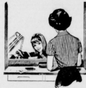
Drive-In Banking Saves Your Valuable Time

Each depositor insured to $20,000 FDIC FEDERAL DEPOSIT INSURANCE CORPORATION