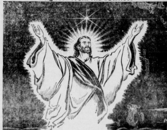
"King of Kings and Lord of Lords" REV 19:16