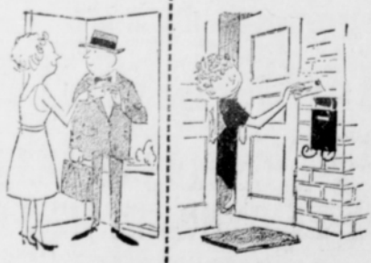
Some folks bank by male... others bank by mail... but nearly everyone banks at