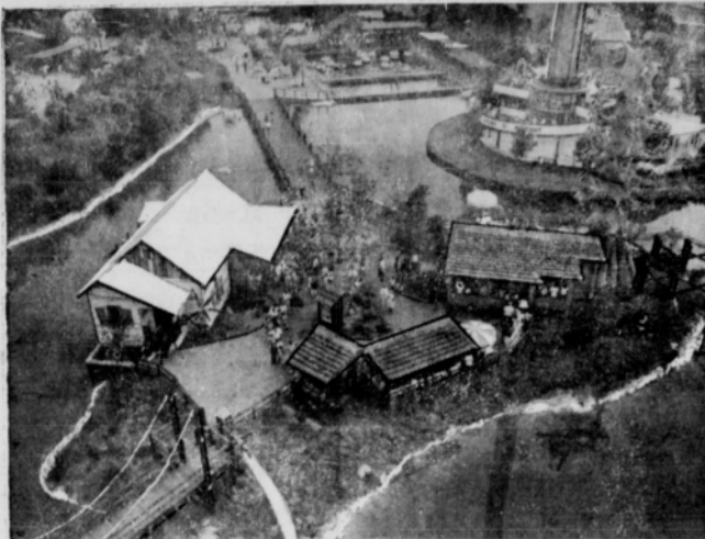
A TREASURE ISLAND OF FUN... Astroworld's new and exciting Fun Island features: The Swamp Buggy, Wacky Shack, and a wobbly Suspension Bridge. Astroworld will be open during the Fall weekend season, Sept. 5 (including Labor Day, Monday, Sept. 7) through November 1, $4.50 adults and $3.50 children.