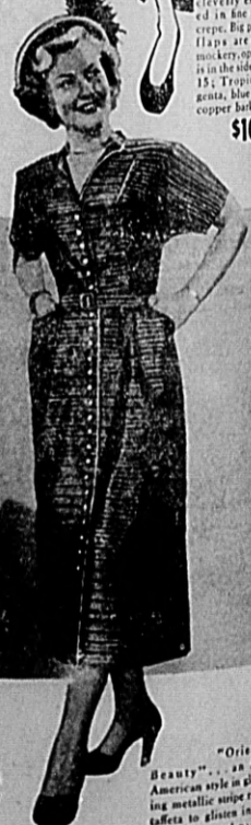
"Oriental Beauty", an All-American style in shimmering metallic rayon tulle. Effects in late afternoon and night. 9 to 15; Gold & purple, Rose & Royal; Teal & white. $12.95