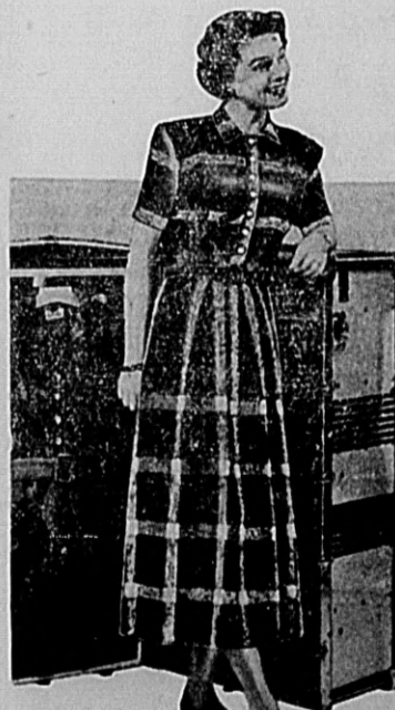
"College Medley", a spirited plaid of wool and rayon to keep a slender waist. 9 to 15; Carbon blue, London green, Peat brown. $8.95