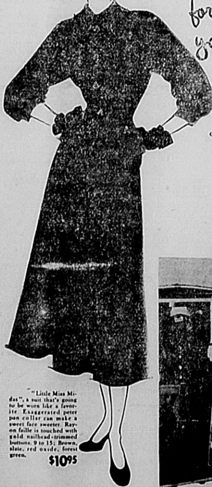
"Little Miss Midas", a suit that's going to be worn like a favorite. Exaggerated Peter Pan collar can make a sweet face sweeter. Rayon tulle is touched with gold nailhead-trimmed buttons. 9 to 15; Brown, slate, red oxide, forest green. $10.95

If you're looking for a versatile Fall Wardrobe... and what girl isn't?... then you'll choose Carole King junior dresses! Outfit yourself for any occasion in this season's most popular fabrics... and at prices you can afford!