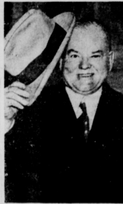
Former President Herbert Hoover smiles for the cameraman as he rounds out his sixty-fourth year. The veteran Republican leader, who will celebrate his birthday anniversary Wednesday August 10, was born in 1874 at West Branch, Iowa.