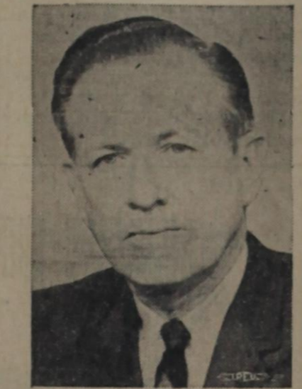
Cong. Omar Burleson

As the Ways and Means Committee began its hearings on the President's economic proposal, with Secretary John Connally testifying, Congressman Burleson, representative from this district of Texas, made inquiry about removing the tax on pickup trucks. Burleson pointed out that many farm and ranch families do not own an automobile but use their pickups for both pleasure and business. "It becomes the family car in a great many instances," he said, and indicated there is often little distinction between the use of automobiles and pickups. He continued, "It seems to me that it is discriminatory unless