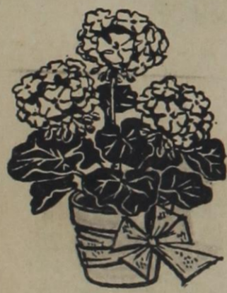
FLOWERS FOR ALL OCCASIONS