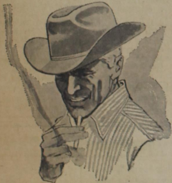
The Ft. Worth

The Westerner who chooses a horse that sits well also demands a Western hat that fits nice and easy. The exclusive "Self-Conforming"® suspended sweatband gives instant comfort from the first time it's put on. Try one on today — see how real comfort should feel.