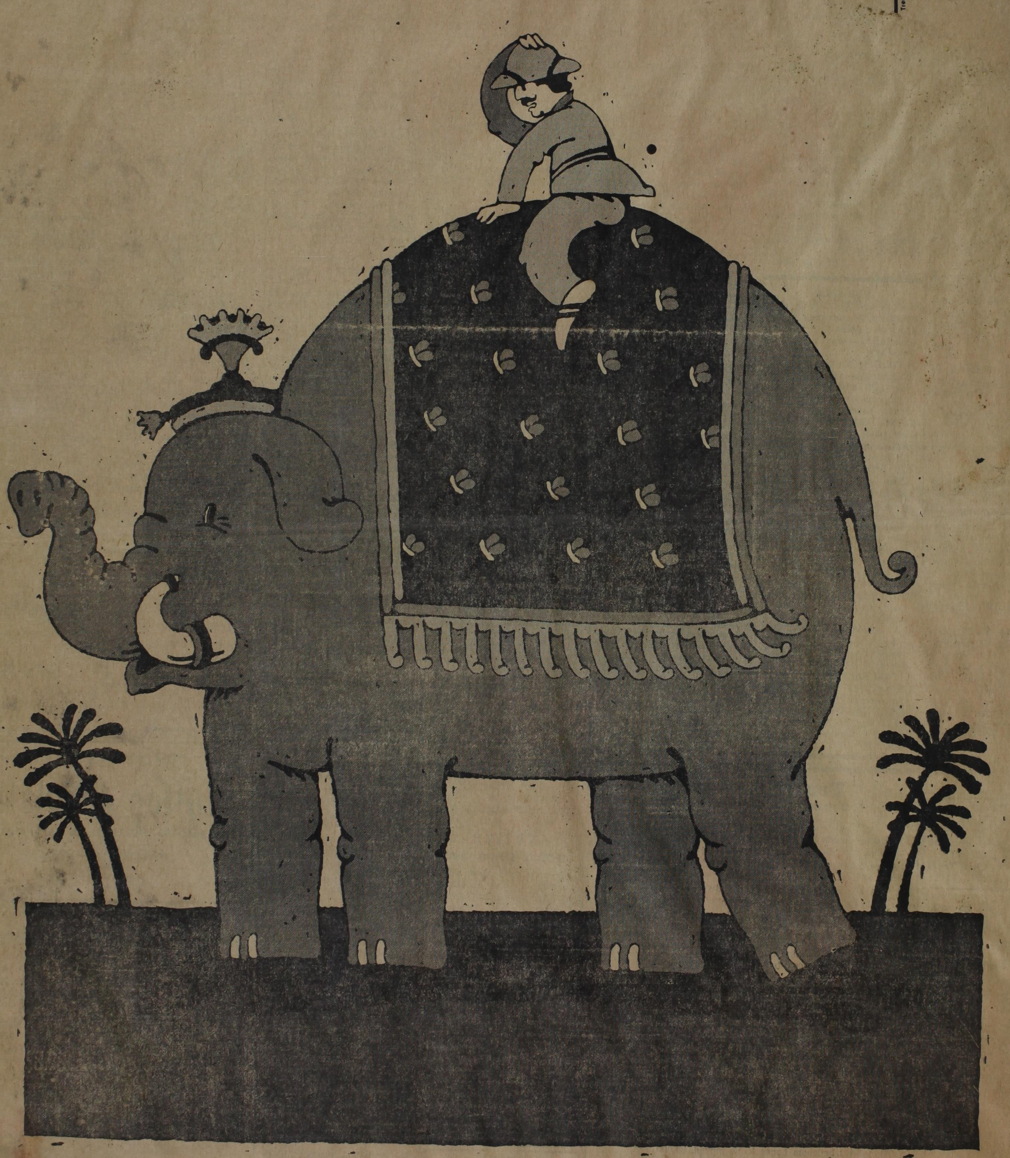
Mall of Abilene opens Wednesday March 14. Welcome Home.

nce man safaried far and wide to find what he was looking for. It wasn't easy. Climbing up and down elephants. Going back and forth across the Dark Continent. In and out of danger. Looking high and low for the things you couldn't find at home. *But that was before us. *Mall of Abilene. *We're 90 bright and beautiful new shops. Brimming with all the things you're looking for. Without looking far. Because we have them right where you want them. *Here you'll find that special dress or a simple shirt. Dazzling diamonds or the basic blazer. Hand tools and footballs, sofas and loafers, pots or pants, or just a great time. *And while we're all that you're looking for, we're even more than you might expect. Big, green trees and bright, fresh flowers. Sparkling sunshine and sprinkling fountains. Where you're cool and splashy in the summertime, warm and dry in the wintertime. *We're a place to stroll to shop to experience and enjoy. We're just what you've been looking for. Right here at home. *