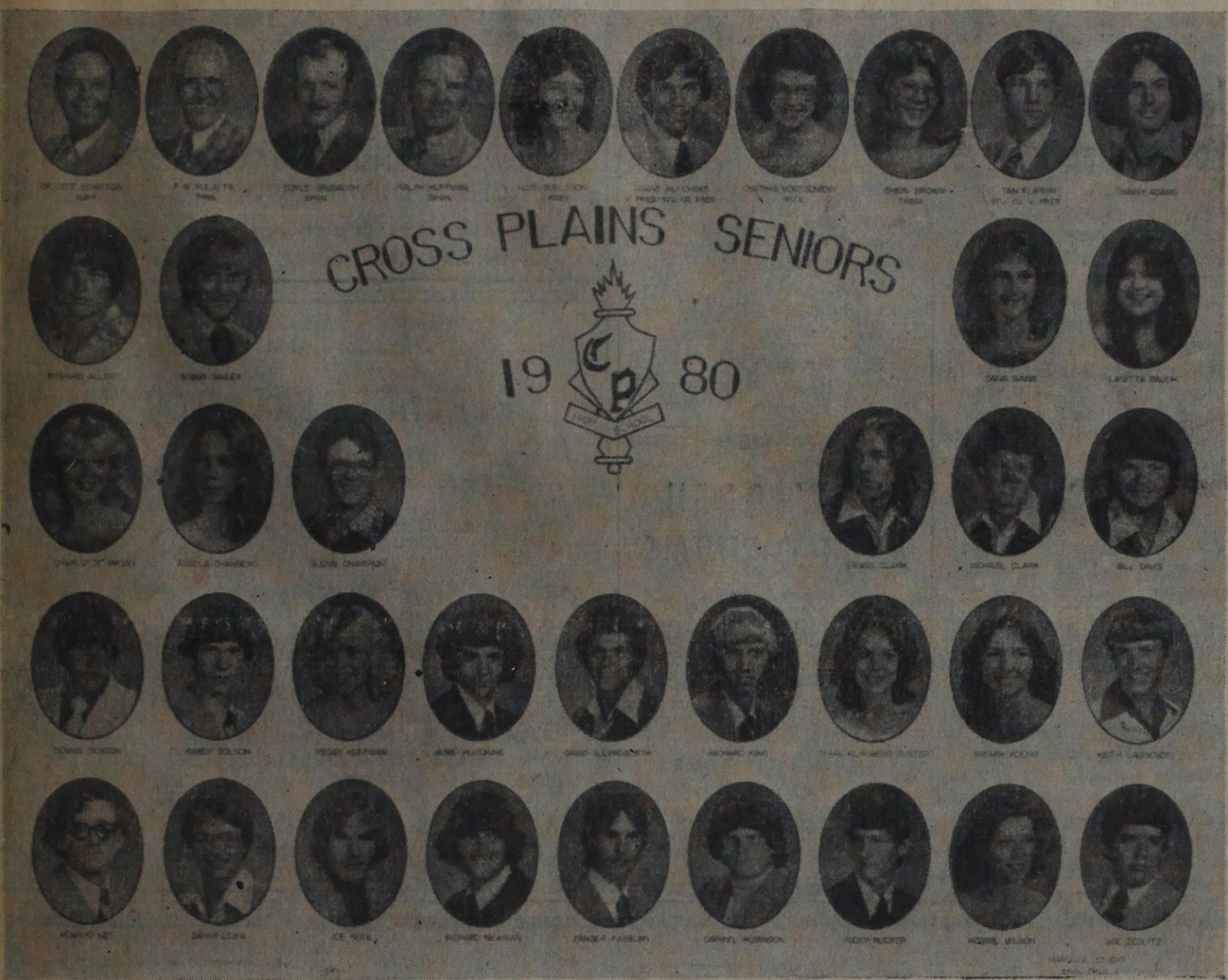
CROSS PLAINS HIGH SCHOOL SENIOR CLASS OF 1980

Barbecue meal served at the banquet was catered.