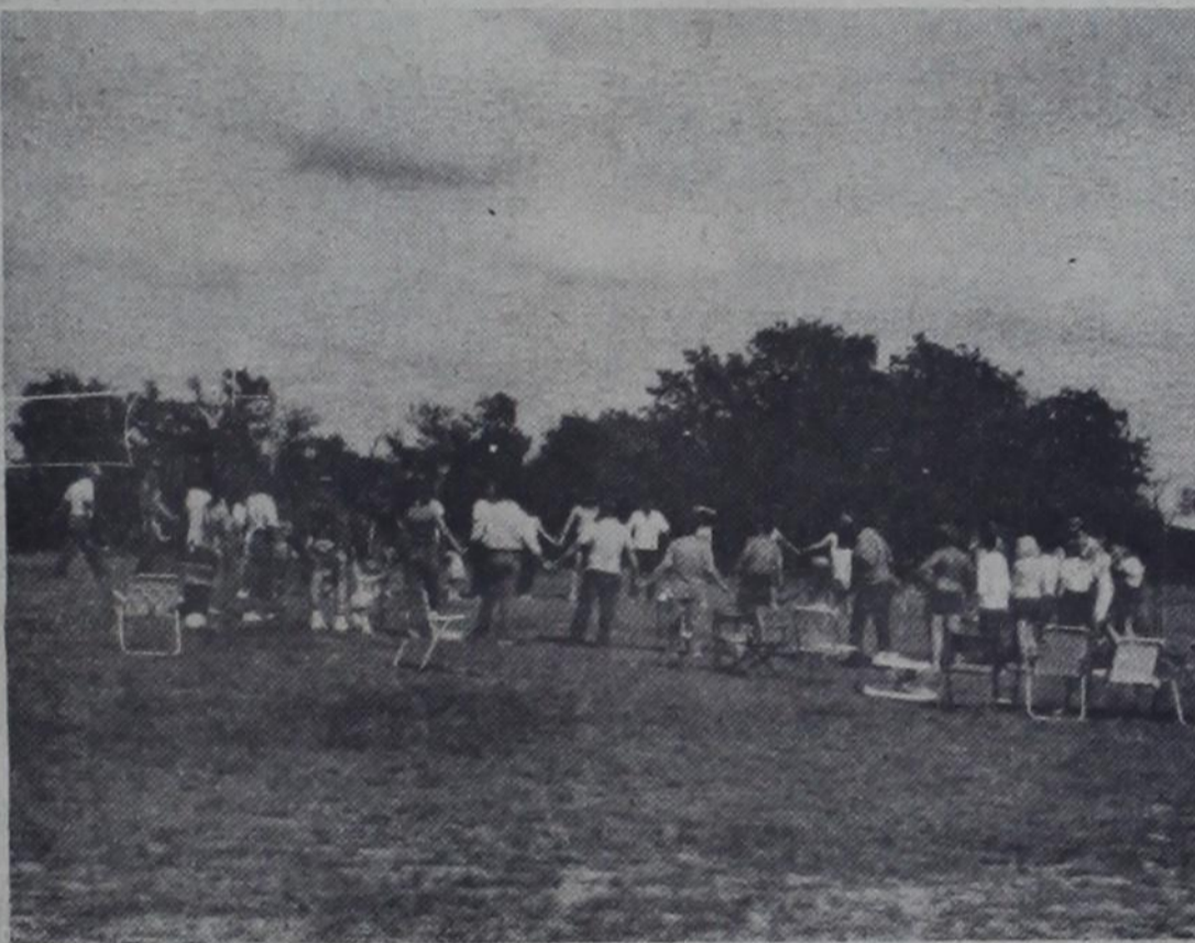
ILLINGWORTH REUNION — Family encircled as a symbolic gesture to