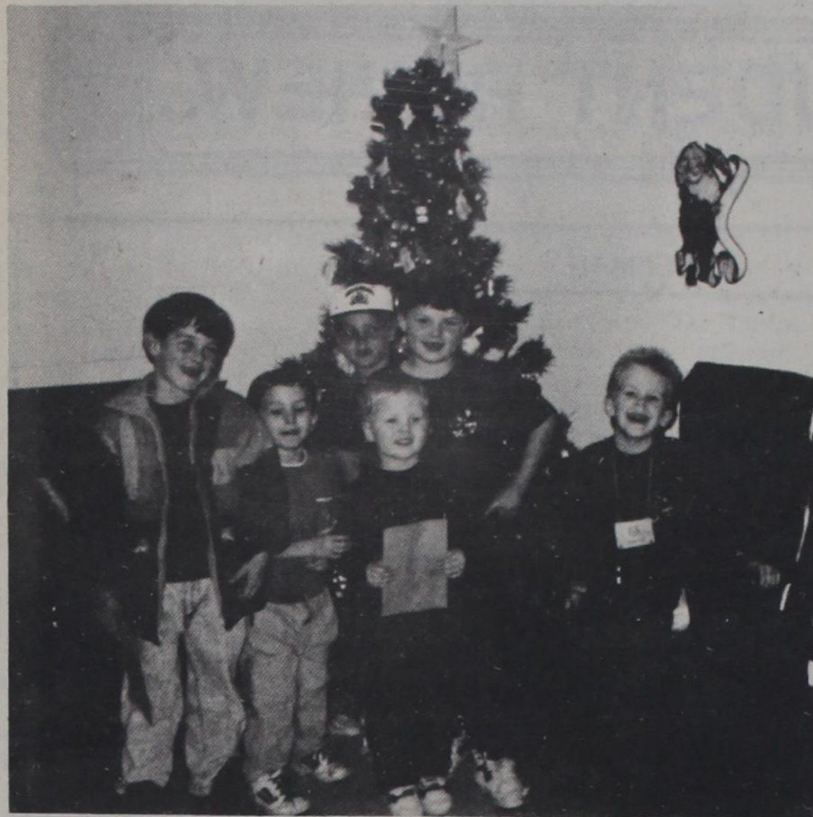
CHRISTMAS PRESENTATION TO NURSING HOME — Tiger Club Scouts present Colonial Oaks residents with a Christmas tree and cards they

Homemade Bone Meal: When you finish with that turkey, boil the bones for soup stock, dry bones 3 days, then grind in hand operated food grinder. Store in tight bag or container. Excellent for slow release calcium and phosphorous for bulbs, tomatoes, vegetables, and roses. Add tablespoon per bush mixed into soil every three months.