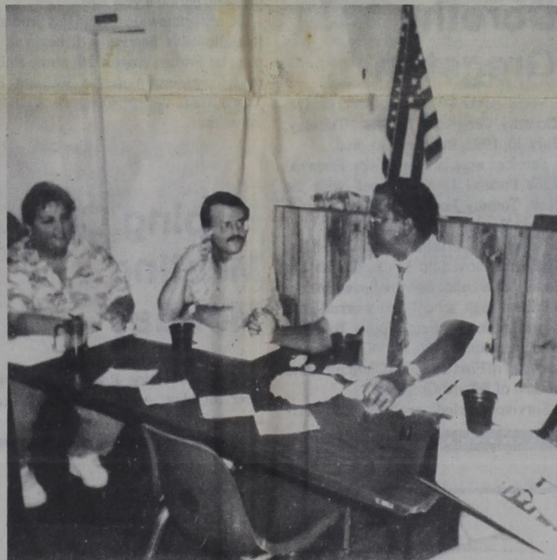
COMMUNITY ACTION PLANNING

Pioneer Pentecostal Church will conduct worship services at Colonial Oaks Nursing Home on Sunday, August 1, commencing at 3:30 p.m.