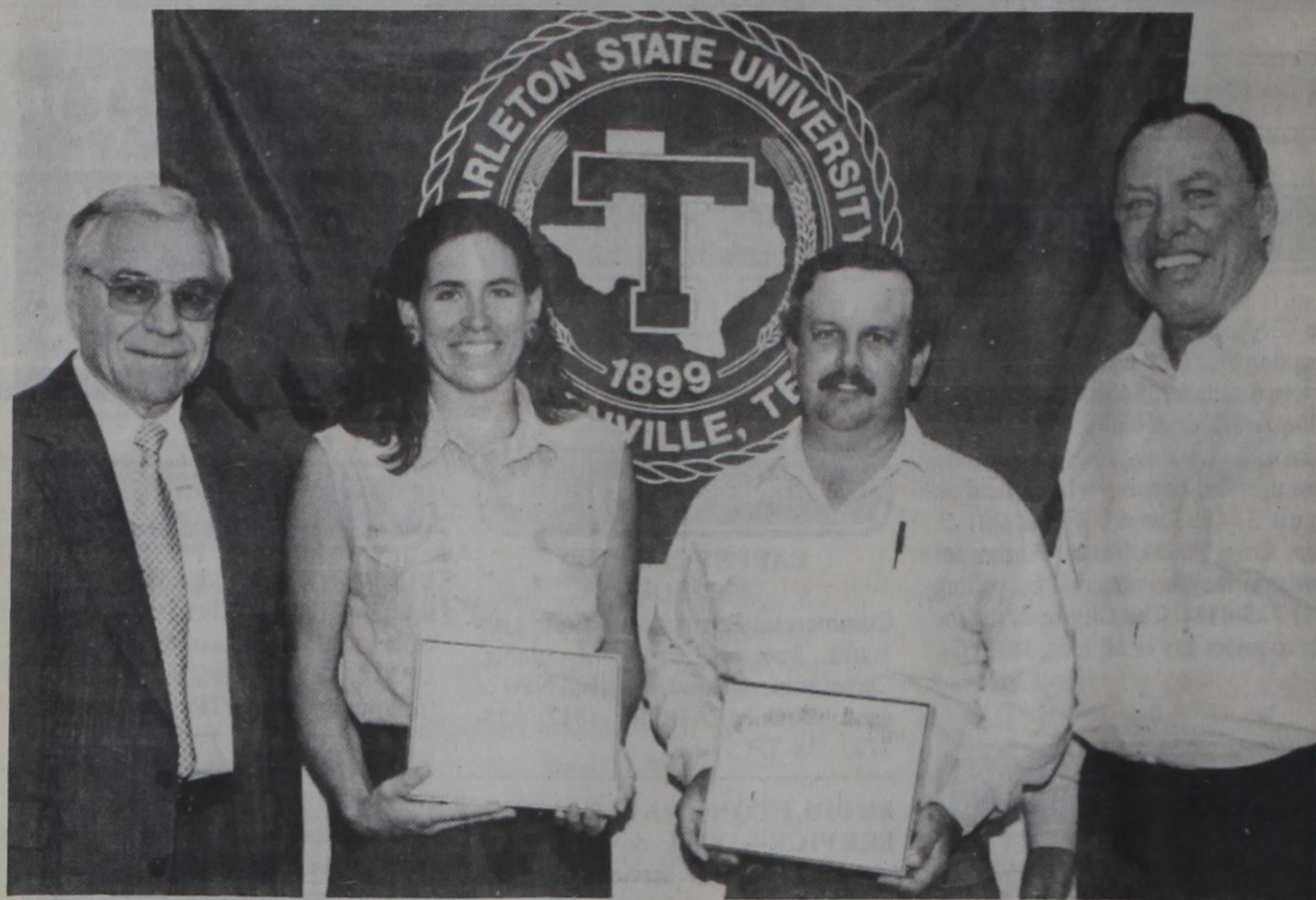
TEACHERS CONFERENCE — The Department of Agricultural Services and Development at Tarleton State University played host to high school agriculture science teachers from across the state this summer as they held their annual Supervising Teachers Clinic.

Senior Class parents will chaperone and parents should be assured that the dance will be well chaperoned and definite rules will be followed. Please feel