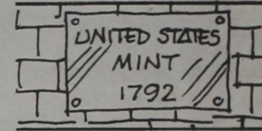
The U.S. Mint was created in 1792.

return to Dallas on Thursday for a doctor's appointment.