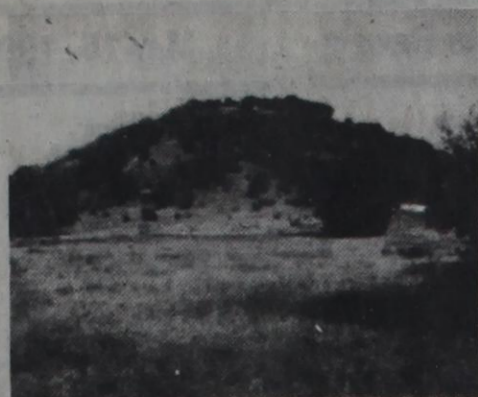
WEST CADDO PEAK