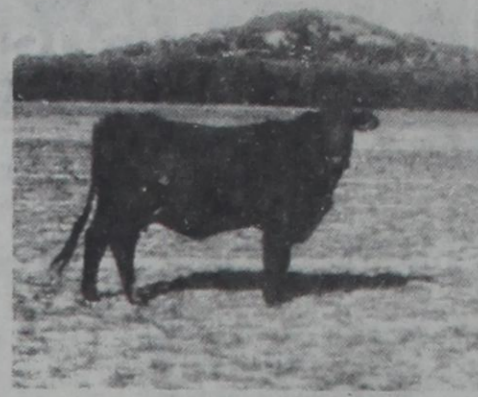
EAST CADDO PEAK Price 50c