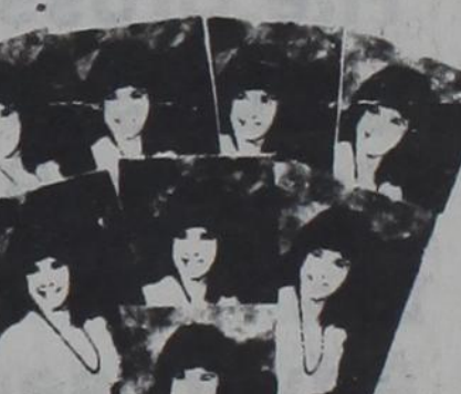
Give a Memory that Lasts Forever "Happy Father's Day"

99¢ Deposit 11.00 Due at Pick up (plus tax)