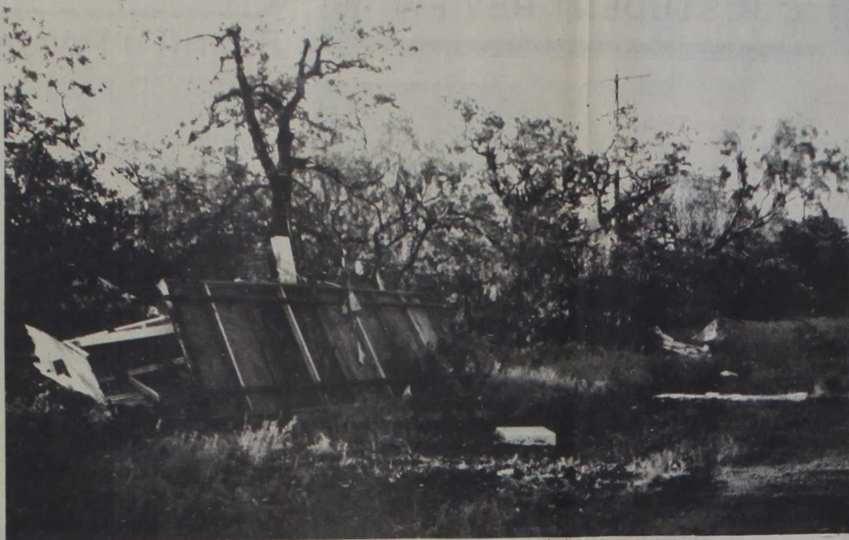
B & R FIREWORKS —after May 29 tornadoes