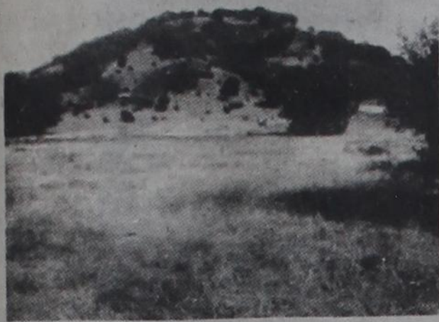
WEST CADDO PEAK Price 35¢