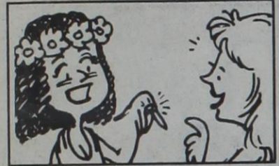
Engagement and wedding rings were first worn by the ancient Romans.