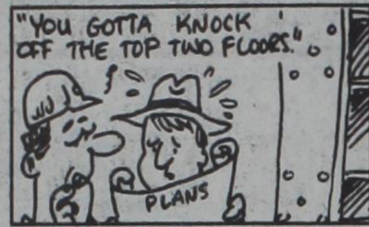
In the city of Washington, D.C., no building may be built taller than the Capitol.