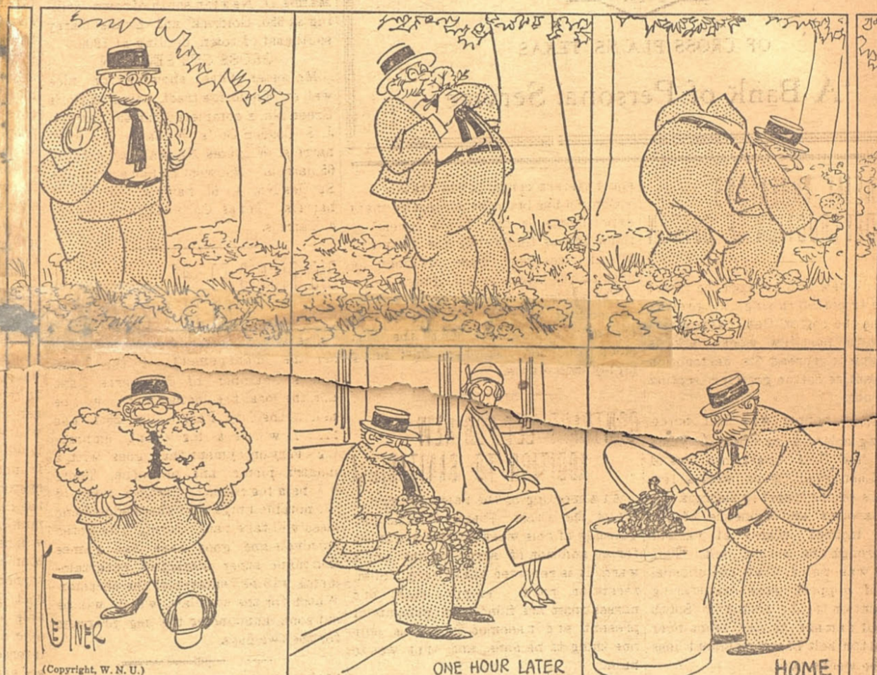
ONE HOUR LATER