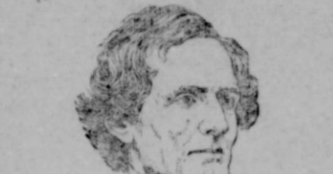
COL. JEFFERSON DAVIS.

More than eighty years ago two Kentucky boys, born in widely different social spheres, entered upon still more widely diverse careers: Abraham Lincoln, in Hardin (now Laramie) county, and Jefferson Davis, in Christian (now Todd) county; Lincoln born February 12, 1809, and Davis on the 3d of June preceding.