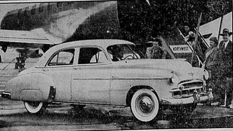
Progressive streamlining of the 1949 Chevrolet is in liner. Notable in the roomier, lower cars is a balance emphasis in this view of the Styleline De Luxe four- in design that adds greater comfort and driving ease door sedan against a new Martin 202 passenger air- as well as smart appearance.

Chevrolet's 'Balanced Design' Adds Beauty and Comfort