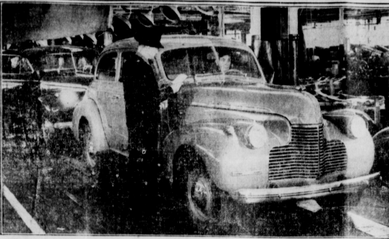
Keeping pace with a demand which, since announcement of the 1940 models, has resulted in a new all-time sales record for any corresponding period in Chevrolet history, that division of General Motors recently built the 700,000th of these models.